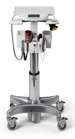
Shown with IQvitals<sup>®</sup> Zone<sup>™</sup> Mobile Cart Option