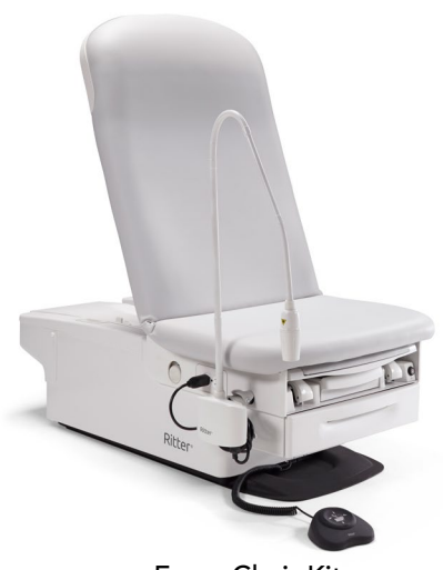
Exam Chair Kit