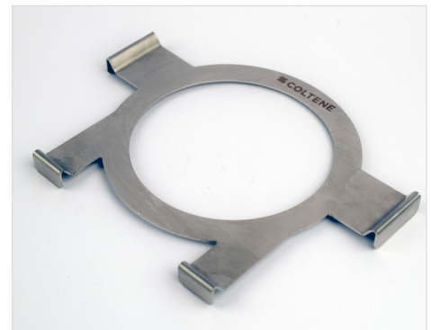
Beaker holder 60022041

Distributed by: SciCan Ltd. 1440 Don Mills Rd., Toronto, ON M3B 3P9 / Canada Tel: 416 445 1600 Toll free: 1 800 667 7733 customerservice@scican.com