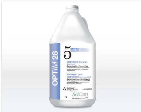
OPTIM® 28 Ultrasonic Cleaning Solution SCI2800